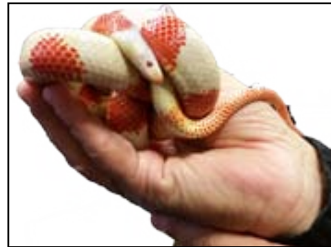
A real beauty, a Honduran milk snake